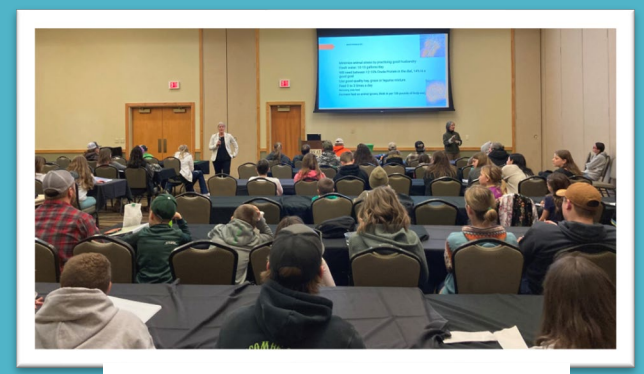
Auburn Moyer Cattle Session with ASL Interpreter