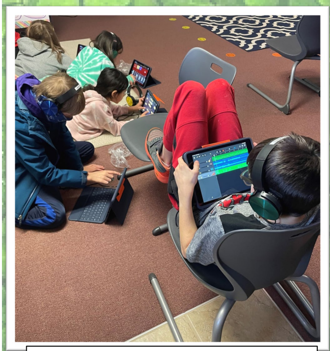
Students Using GarageBand at Suttons Bay Public Schools