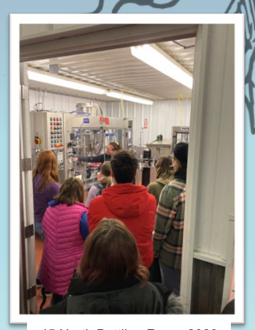
45 North Bottling Room 2023