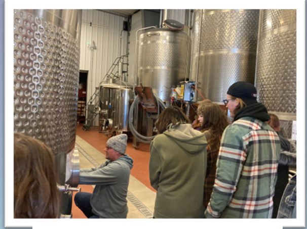
Youth Looking Inside 45 North Stainless Wine Tanks April 2023