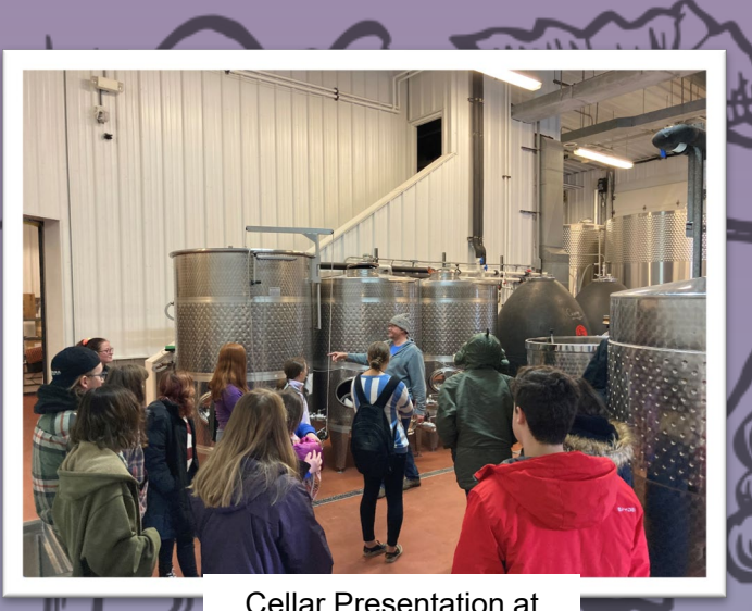
Cellar Presentation at 45 North April 7, 2023