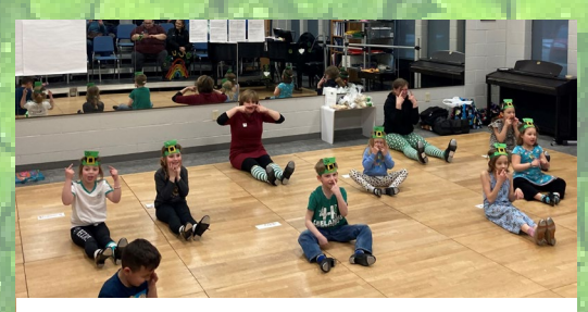
Tiny Tappers Touching Noses and Listening