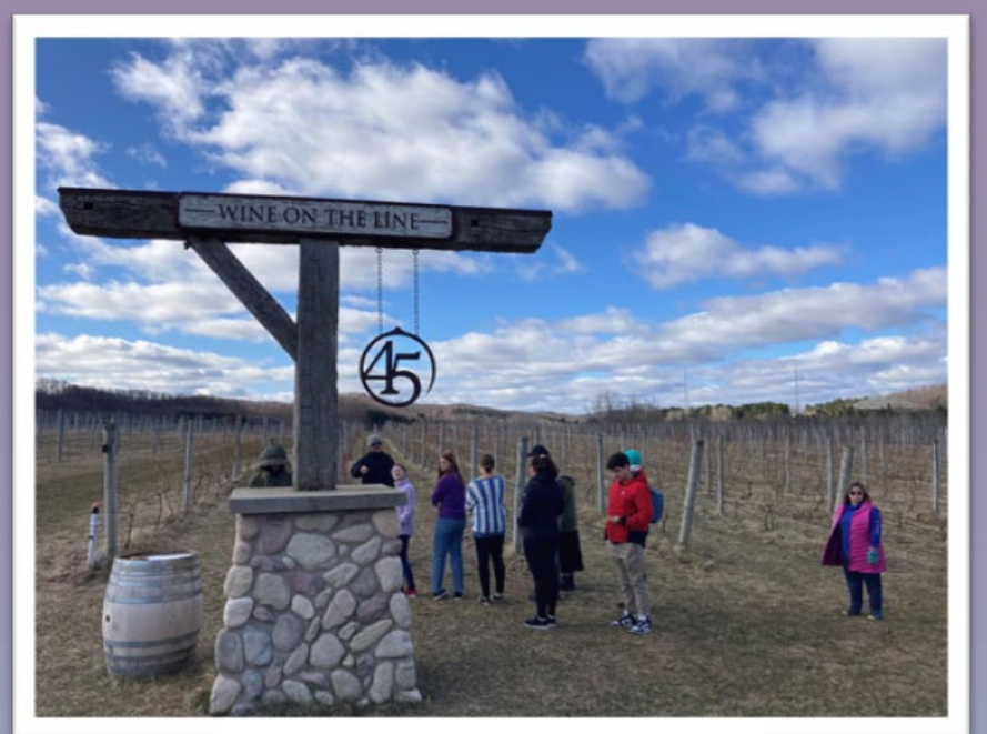
45 North Wine on the Line on the 45th Parallel April 2023