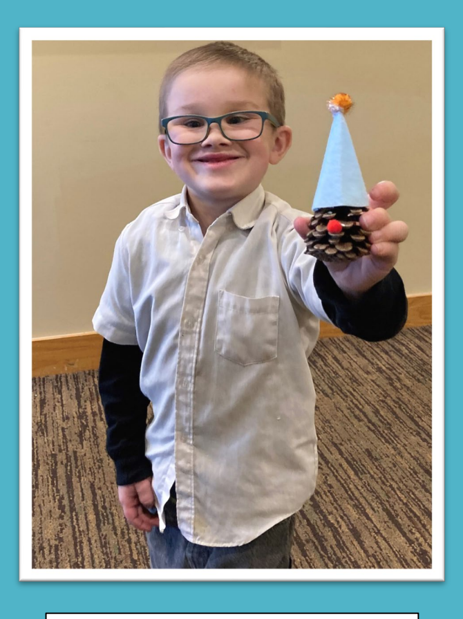
4-H Cloverbud Youth with Gnome from Cloverbud Craft Table at Expo

And save the date, our Expo will be held at the Grand Traverse Resort on Sunday, March 3, 2024