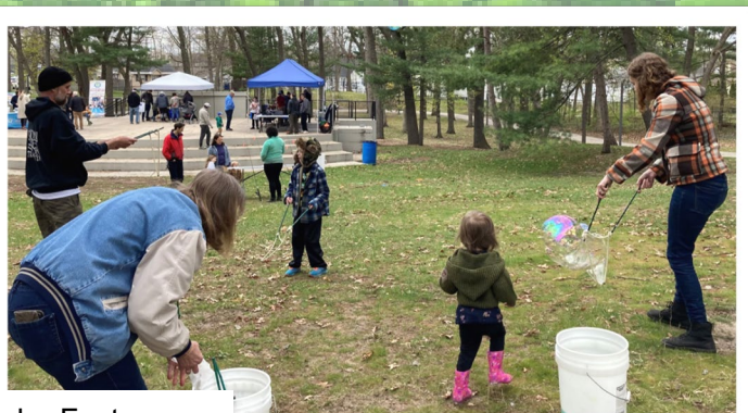
Making Giant Bubbles at MakerFest