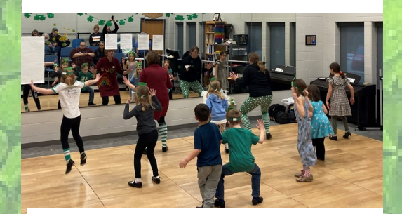
Tiny Tappers Jumping