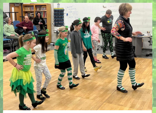
Tap Time March 2023 Performance with St. Patrick's Theme